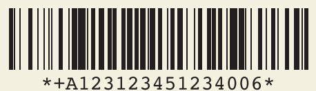
HIBC with NDC in 1D Code 128 symbology