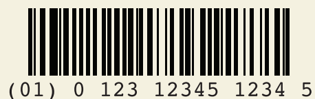
GTIN with NDC in 1D GS1-128 symbology